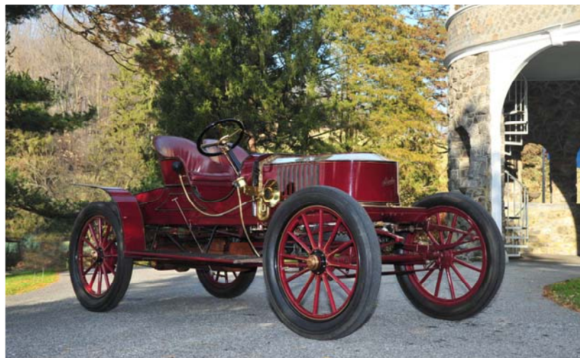
1908 Stanley Model K Semi-Racer (Owned by the Marshall Steam Museum)