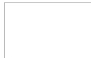
Half Page 7.5" x 4.75"