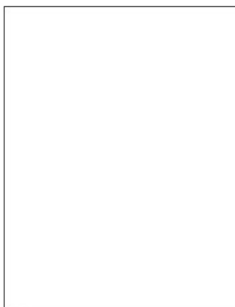
Full Page 7.5" x 10" non-bleed 8.75" x 11.25" with bleed

All advertising materials must be received by September 5, 2017 , in order to appear in the 2016 event catalog. We accept high-resolution (300 dpi) PDF or JPEG digital files. Advertising layout and design services are available at an additional cost.