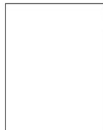
Quarter Page Vertical 3.75" x 4.75"