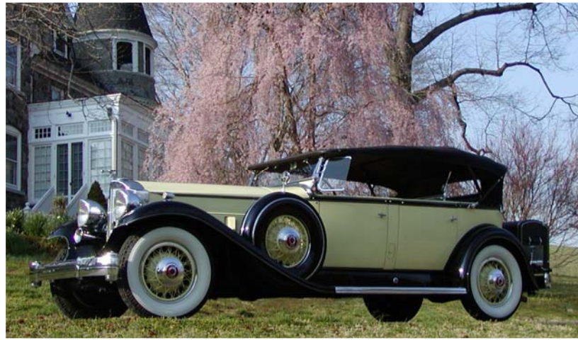
1932 Packard Phaeton (Owned by the Marshall Steam Museum)